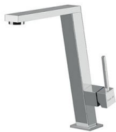
Mixer Tap Master 8493 000